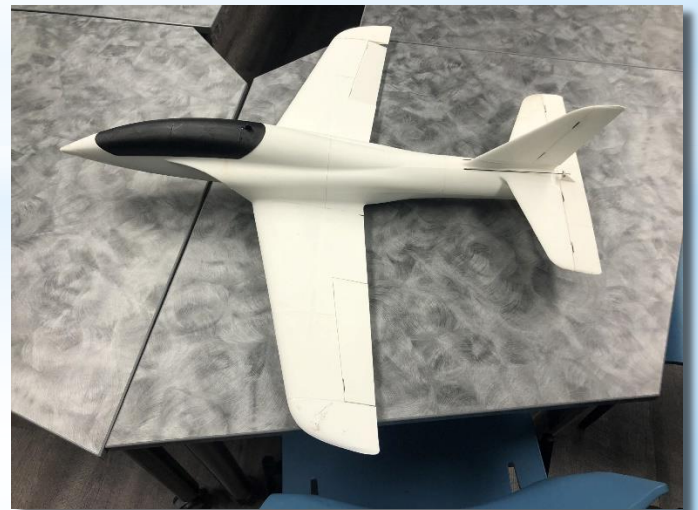
Kevin Siverd's Cobra 50 mm ducted fan jet, running 4S lipo. Completely 3D printed.