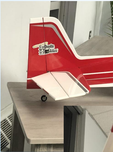
Dan Vensel's Hangar 9 10cc ARF with Power 46 motor, six MG servos, 96" wing, 12x8 prop, two 4 cell lipos in parallel totaling 8,000 mah.